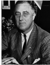
Franklin Delano Roosevelt: Leader of the USA.