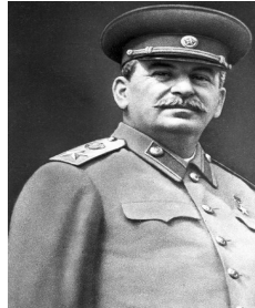
Josef Stalin: Leader of the USSR.