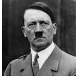
Adolf Hitler: Leader of Germany.