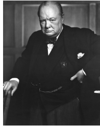
Winston Churchill: Leader of Britain and its Empire.