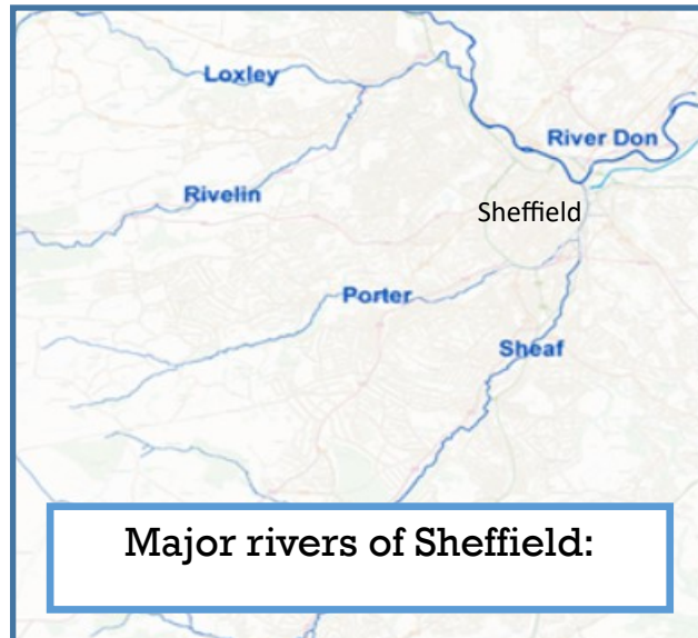
Major rivers of Sheffield:

All rivers tend to follow the same pattern; as they flow from the source to the mouth; they start off narrow and become wider; they start off straight and end up meandering .