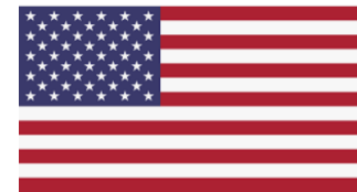
United States of America

Largest lakes: Lake Superior (US 31,700 square miles), Lake Huron (US 23,000 square miles), Lake Michigan (US 22,300 square miles)