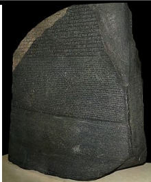
A stone that had the same inscription written both in Greek and in Egyptian hieroglyphics. It was helpful in translating hieroglyphics.