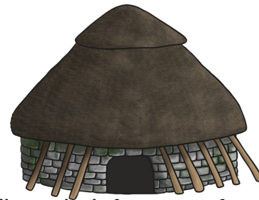
A roundhouse built from stone from the Neolithic Era.