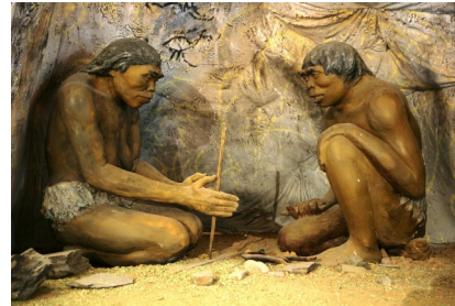
Humans sheltered in caves in the Paleolithic Era.

The Stone Age diet would have varied according to what was available. Berries, nuts, seeds, roots , herbs, insects, snails and eggs are some of the foods that were gathered .